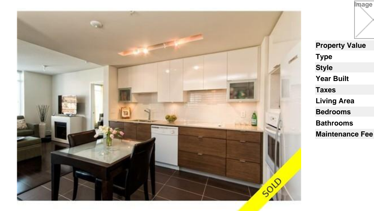
Image not found or type unknown Property Value $447,000 Туре Condo Style Inside Unit Year Built 2008 Taxes 1971 Living Area 784 sq.ft. Bedrooms 2